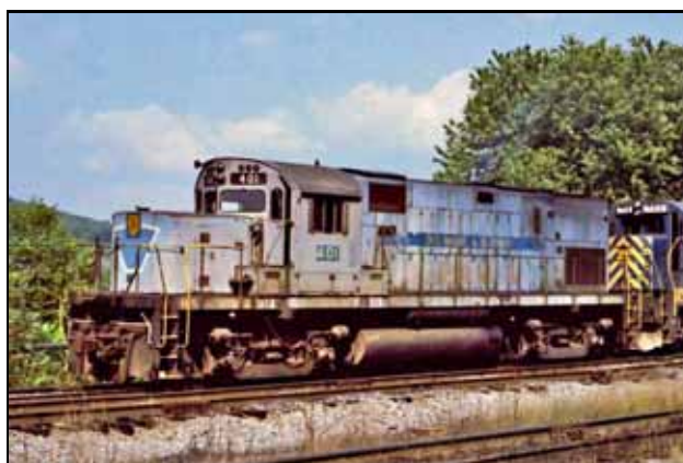
Alco Century 420 No. 401 is at East Binghamton in 1981, wearing its original Lehigh & Hudson River colors, having escaped repainting while on the Conrail roster.