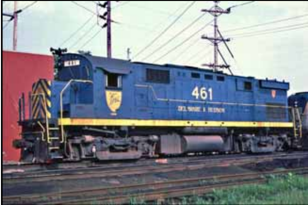
Alco C424m 461 displays the blue paint scheme with yellow stripes. All of the C424m fleet arrived from GE Hornell shops painted in this scheme, the only class of "new" locomotives to be delivered as such.

out the Seventies, the solid blue scheme morphed into a slightly more colorful and visible blue body with solid yellow nose, which looked out of proportion on some Alco units. Finally D&H settled on a solid blue body with diagonal yellow stripes on both ends, yellow side sill, with large