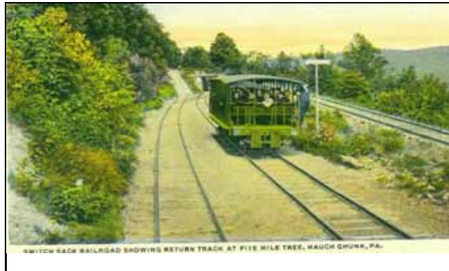
SWITCHBACK RAILROAD SHOWING RETURN TRACK AT FIVE MILE TREE, MAUCH CHUNK, PA.

Pisgah and Mount Jefferson. The return track construction incorporated an existing switchback line that ran from Summit Hill to the LC&N Panther Creek Mines. Two Panther Creek Planes, Nos. 1 and 2, became the beginning of the gravity car track unloading system at Mauch Chunk. Prior to 1850 four chutes 600' to 700' long fed coal from the railroad