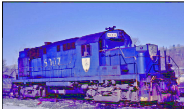
Low nose RS11 5007 is in the all-blue austerity scheme, which featured silver/gray trucks. The roman style lettering and large block numbers are fading away.

Or make that, personalities, given the many faces of the carrier. D&H was not quite the Sybil of the railroad world - that title would have to go to the Rock Island - but at least in the Northeast, D&H would be the champion. The beloved Lehigh Valley Railroad was famous for its myriad paint schemes applied to