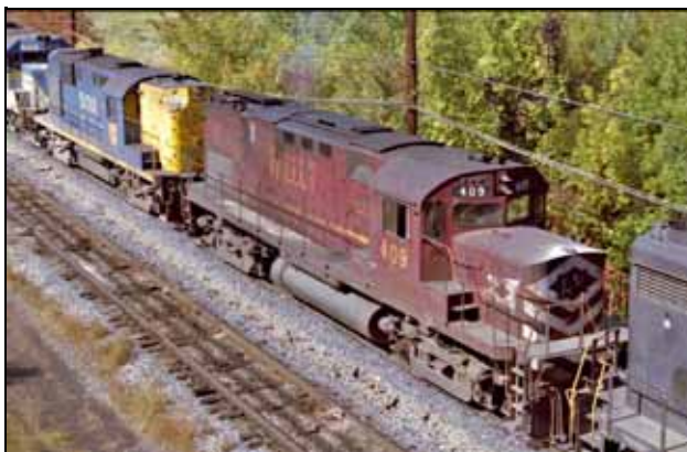
Lehigh Valley Alco C420 409 keeps its fallen flag colors after five years on the D&H. Unlike the GP38-2s, the Centuries retained their original LV numbers. Another unusual Alco, yellow-nose RS11 5001, trails behind.

repainted in the traditional lightning stripes. Also in 1976, to commemorate the nation's bicentennial, D&H adorned a U23B and an RS3u in a patriotic red, white, and blue scheme. In 1972 D&H had tried an experimental blue and yellow paint job on RS36 5015 that featured big "D&H" letters on the car-body sides. This one of a kind scheme never caught on, but beginning in 1977, the first of several solid blue variations were applied, first on RS11 5002, which featured silver trucks and script lettering. Another RS11, the 5007, sported a similar scheme, only with block lettering. Most of the surviving RS3 fleet was dipped in solid blue. The color was alternately called Avon blue or Altschul blue, in reference to austerity-inducing D&H president Selig Altschul. The simpler, cheaper paint jobs seemed to spell an end to the cherished blue/gray/yellow scheme. Rounding