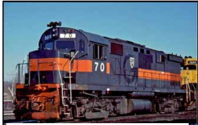
Alco C424m #70, renumbered and repainted by Guilford, is back on the D&H in this 1990 view at East Binghamton. The Guilford G and Springfield Terminal lettering have been painted out and replaced with a D&H shield stencil. Other GTI painted units ran with intact D&H lettering.

this time, it became apparent that the blue paint jobs on other units had been hastily applied over the locomotive's original colors, creating a strange phenomenon as the blue paint faded and washed away: the engines changed color. Former LV units faded to a powder blue (think of the Crayola color periwinkle) while RDG units turned an aqua blue. By 1986, one ex-LV Geep, No. 7324 had almost