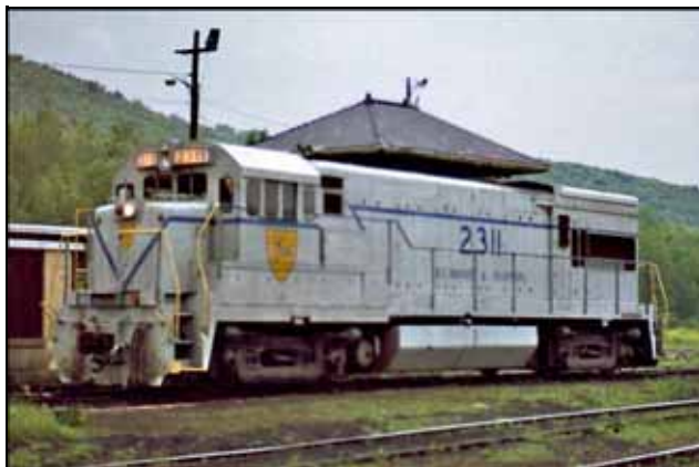
General Electric U23B 2311 displays its unique "Gray Ghost" paint scheme under appropriate twilight at the East Binghamton yard tower in 1982.

decade of dieselization, the D&H fleet was the exact opposite: all locomotives wore the same basic black paint with yellow lettering. Things got colorful in