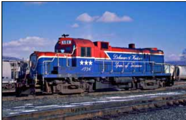
Above, Alco RS3u 506 was painted in this Bicentennial scheme in 1976 and was still looking good ten years later on a sunny morning at East Binghamton. The unit now works for the Tioga Central tourist railroad, amazingly retaining its patriotic colors after 35 years.

yellow numbers. This was basically the scheme brought over by the former Reading Geeps, with blue swapped out for green. Some yellow-nose units were retouched with this final variation. One constant of all D&H paint schemes was