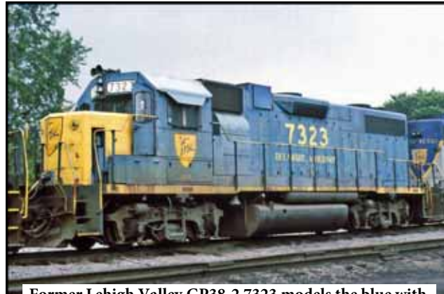
Former Lehigh Valley GP38-2 7323 models the blue with yellow nose scheme. The unit is fading to a pastel blue which was common.

If a railroad's personality is characterized by its locomotive fleet and paint schemes, then it can be said that the Delaware & Hudson had a lot of personality.