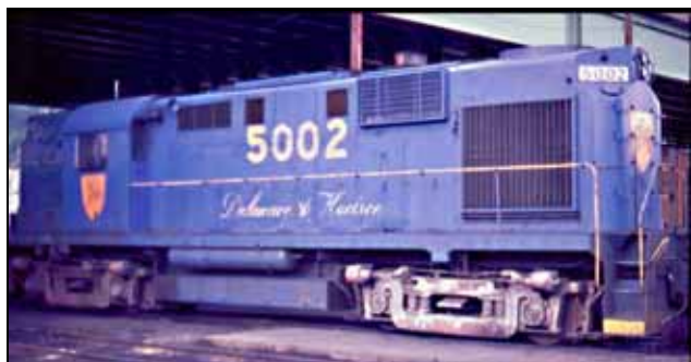
Alco RS11 5002, originally built for the New York Central, is seen at Bevier Street yard in Binghamton in 1980 wearing its unique solid blue scheme with script lettering. The unit survived on D&H property until 1994, one of the last Alcos to leave the roster, still wearing this scheme.

ex-Lehigh & Hudson River C420 2077. As a bonus to the railfan world, the Alco, which was renumbered 401, arrived still in gray and blue colors of the L&HR, adding a third fallen flag paint scheme to the D&H fleet. As fate would have it, this engine would